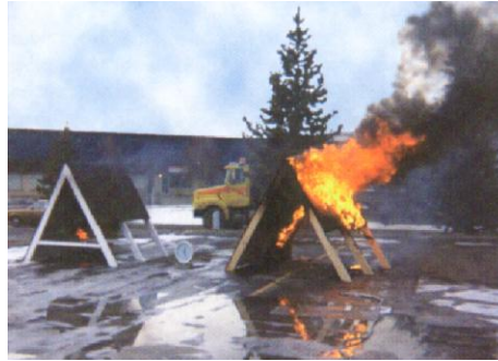
SafeCoat® coated interior roof space and an untreated roof space under identical fire conditions

manufacturers in their products or systems. Whether ASTM, UL, CSA, NFPA or other codes, SafeCoat® Latex can help you meet code requirements.